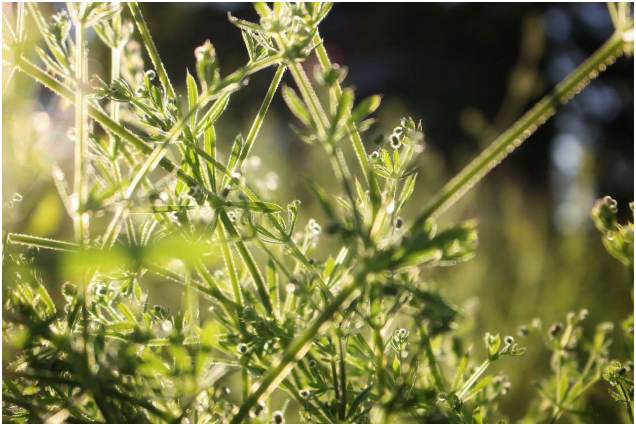
Rebecca Adelt Lomas (2025) Overgrown Newsham , Photograph, Newsham Park

LEVEL 6 HISTORY OF ART AND MUSEUM STUDIES