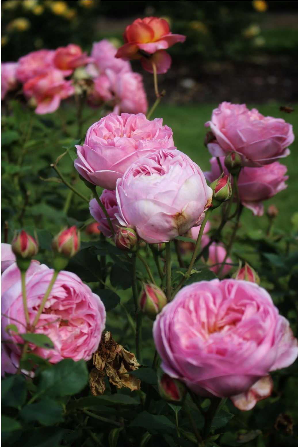
Rebecca Adelt Lomas (2025) Garden Roses , Photograph, Croxteth Park