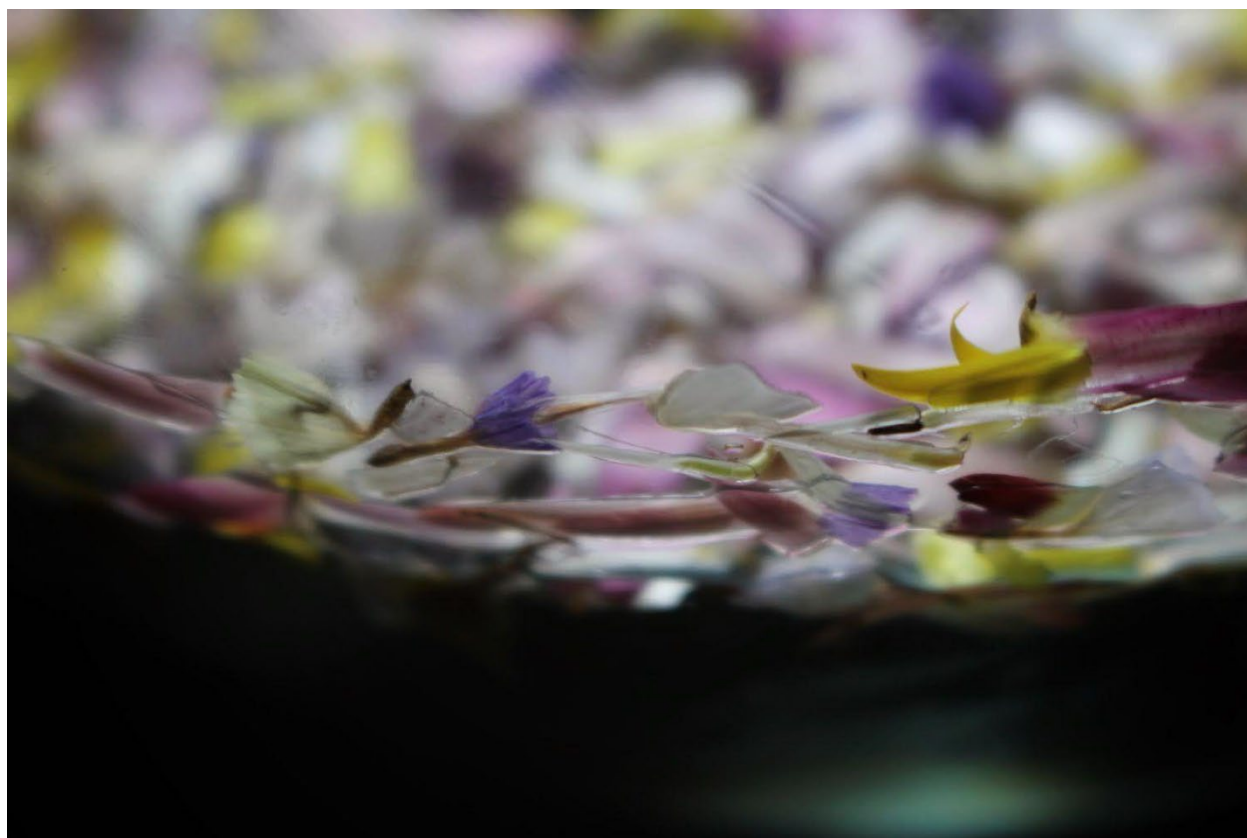
Rebecca Adelt Lomas (2025) Floating Petals 3 , Newsham Park