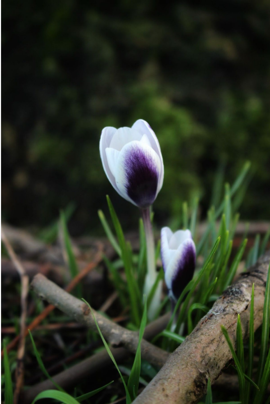
Rebecca Adelt Lomas (2025) Snow Crocus , Photograph, Newsham Park