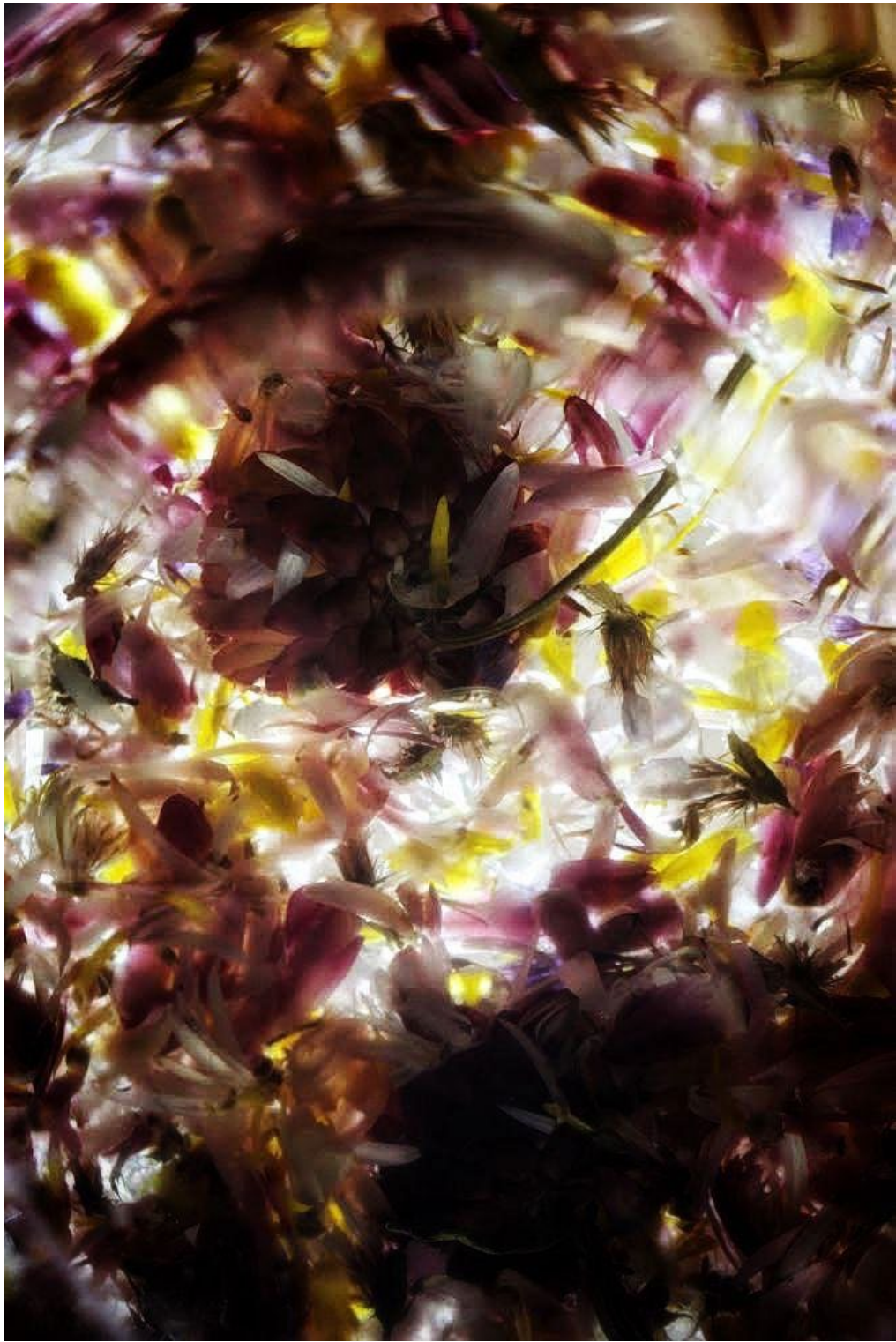
Rebecca Adelt Lomas (2025) Floating Petals 4 , Photograph, Newsham Park