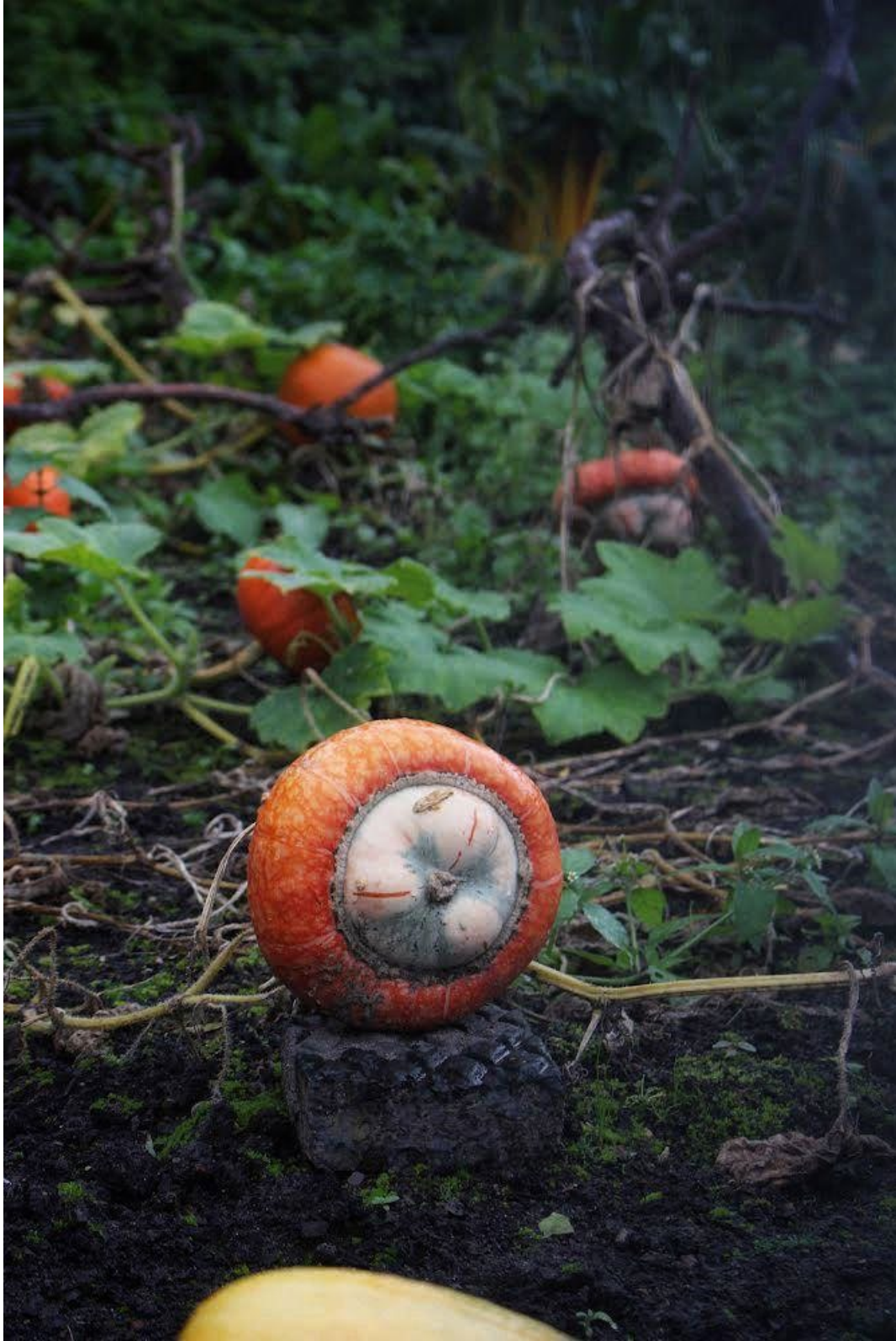
Rebecca Adelt Lomas (2025) Speke Hall Kitchen , Photograph, Speke Hall