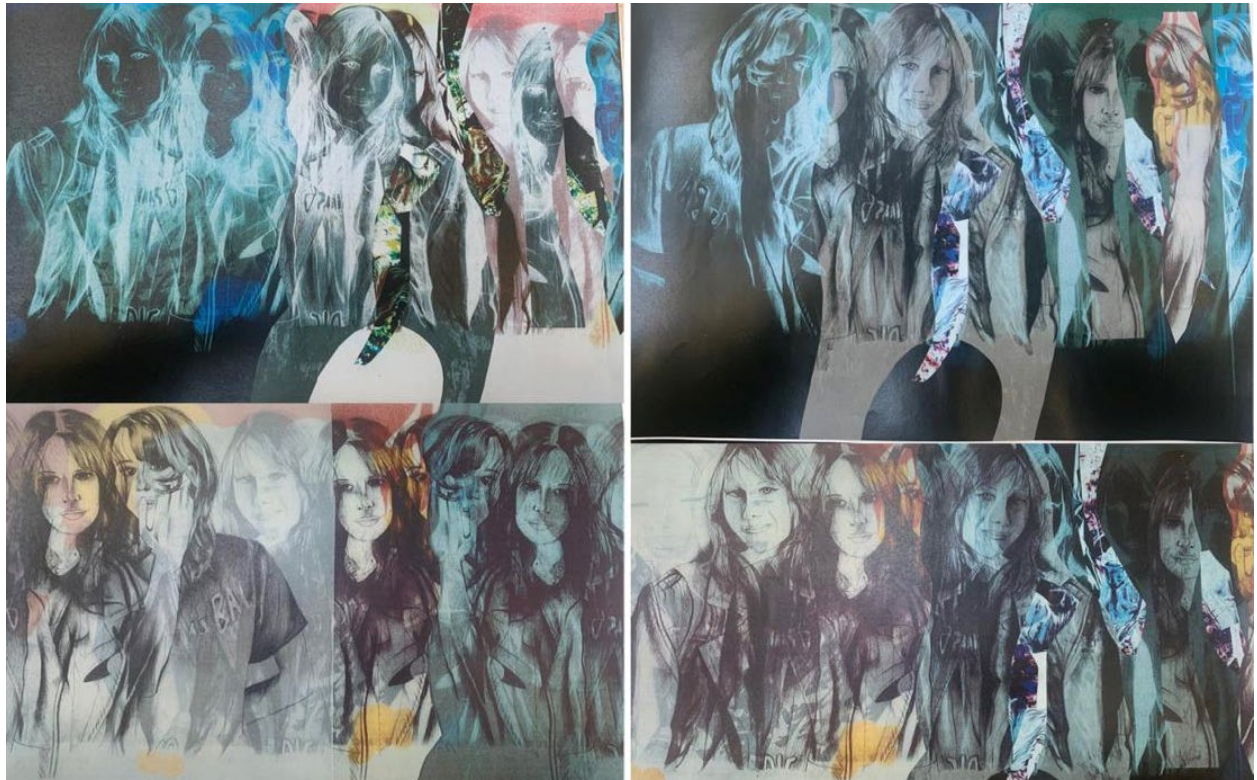
Olivia Foulston (n.d.) Sketchbook Pages