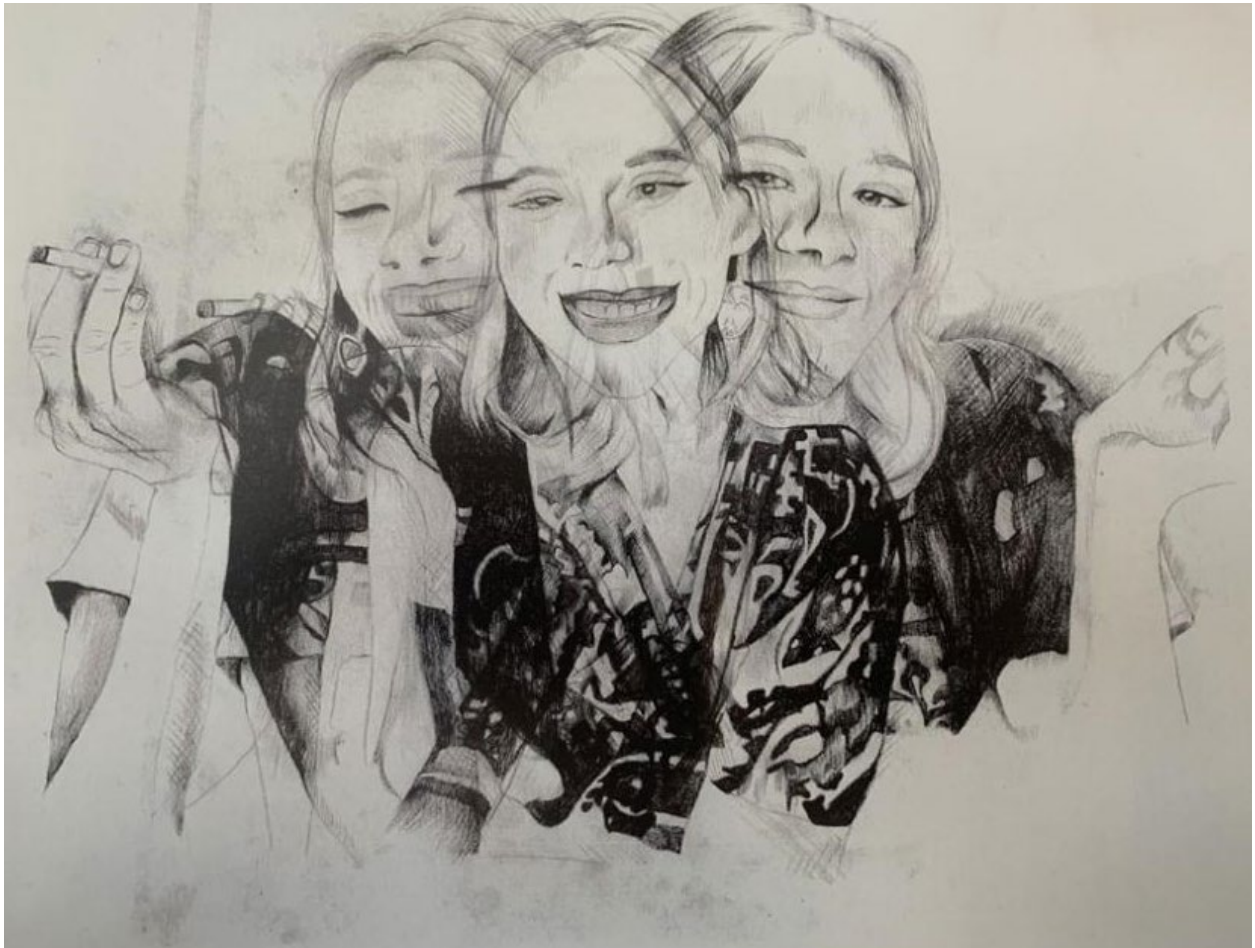
Olivia Foulston (n.d.) Sketchbook Pages